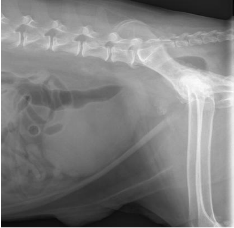
Right Lateral Caudal Abdomen