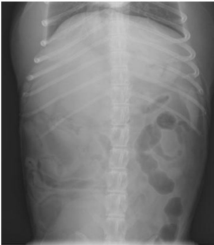
VD Cranial Abdomen