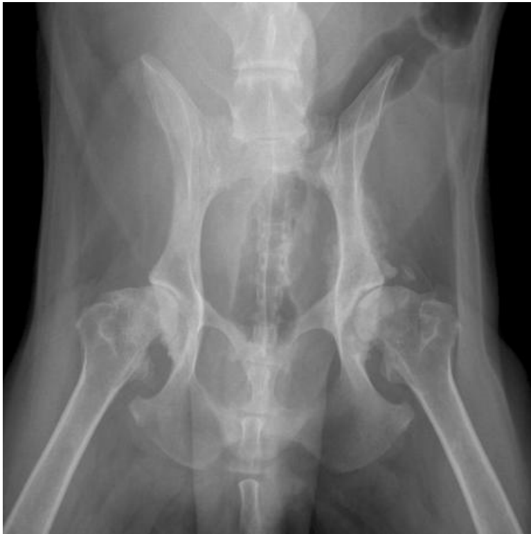
VD Caudal Abdomen