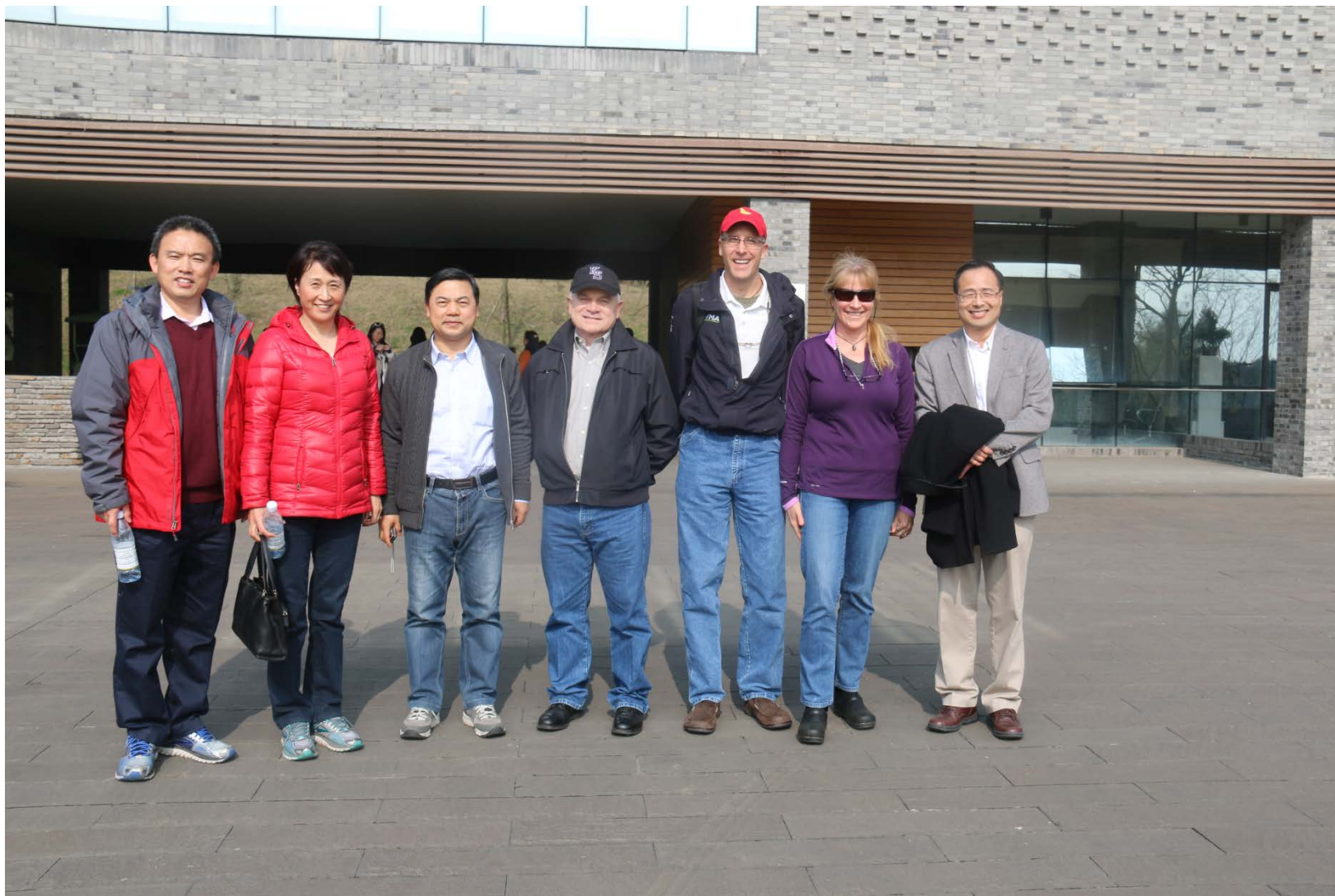
The delegates visited China Giant Panda Protection and Research Center.