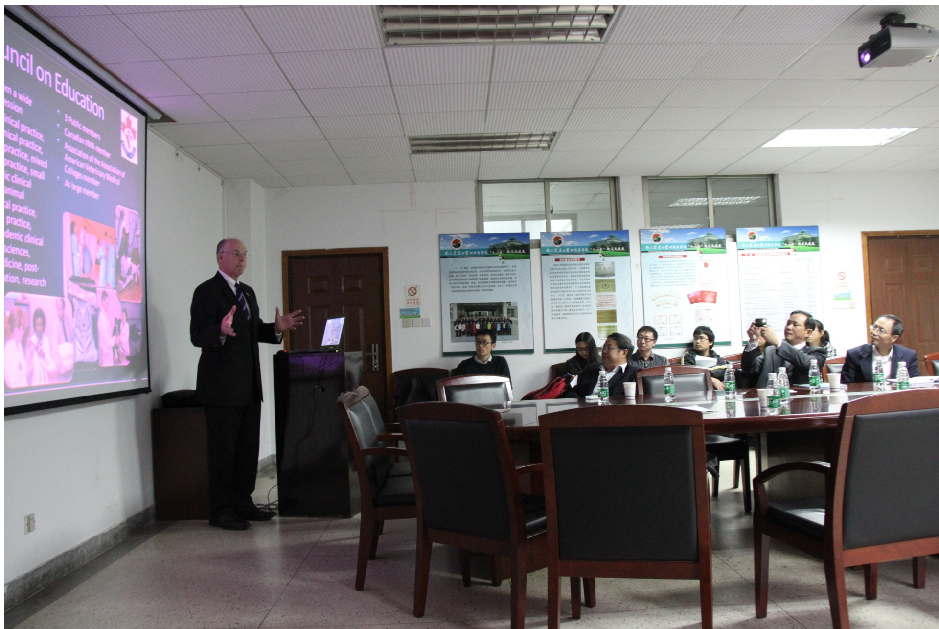
At Nanjing Agricultural University