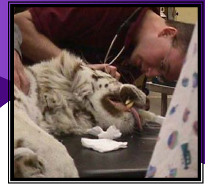
Exotics and Zoological Medicine