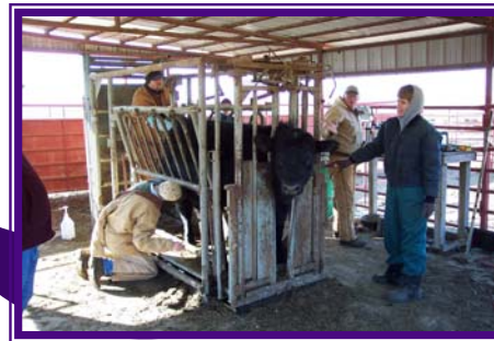
Agricultural Practices: Herd Health and Individual Animal