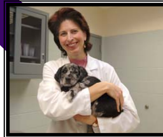
Pet Health Center : Preventative Medicine for Dogs and Cats