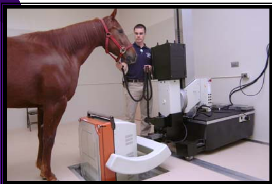
Diagnostic Imaging: Nuclear Medicine