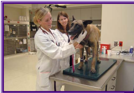
State-of-the-Art Intensive Care Unit— Completed in 2006

Our vision is to be regarded as the premier academic unit among our peer institutions. The pursuit of excellence is the overarching factor in all we do. We seek to be the best at what we do. We put our students first and give priority to what we teach as well as how well our students learn.