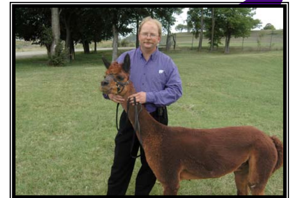
Domestic Livestock: Alpacas and Llamas