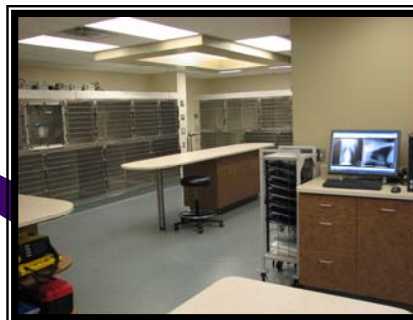
MidwestVET: Referral only Specialty Hospital also includes 1 week at the Animal Emergency Clinic and Nebraska Humane Society