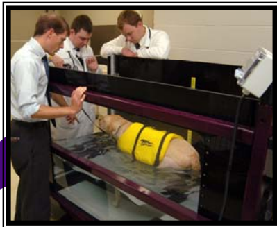
Water Treadmill: Physical Therapy