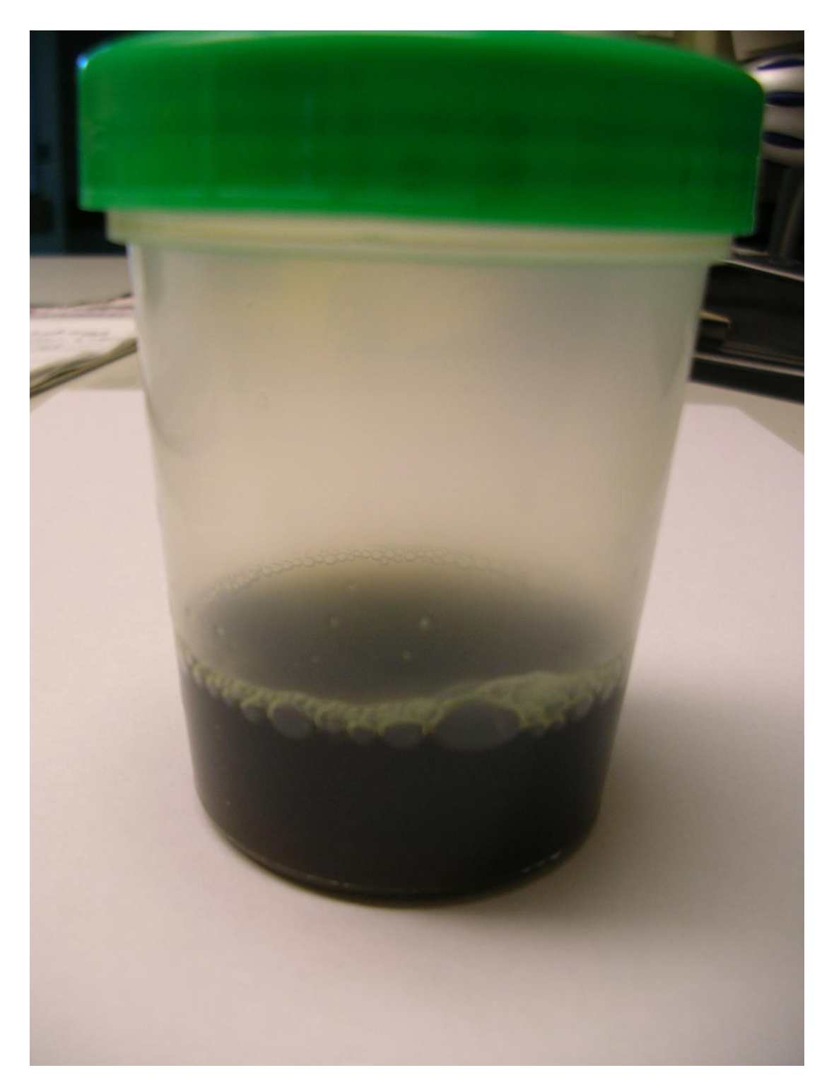
Figure 3. Dark hemoglobin containing urine from a sheep with copper toxicity.