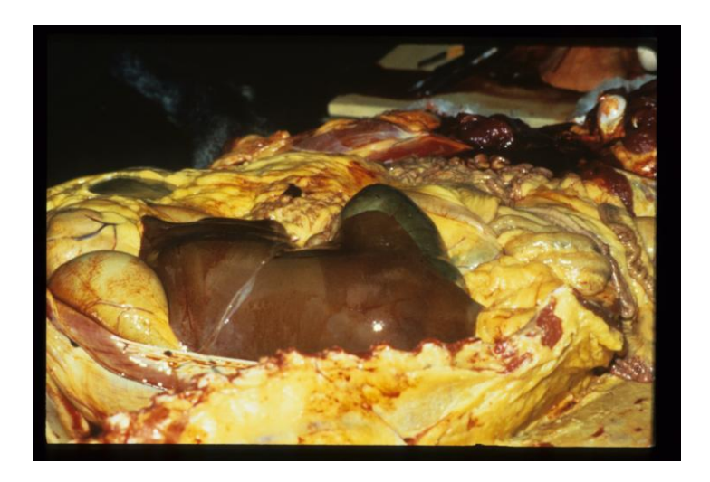
Figure 1: Severe icterus in a sheep with copper toxicity.

<sup>1</sup>Haskell SRR, Payne M, Webb A, et al. Antidotes used in food animal practice. J Am Vet Med Assoc 2005;226(6):884-887.