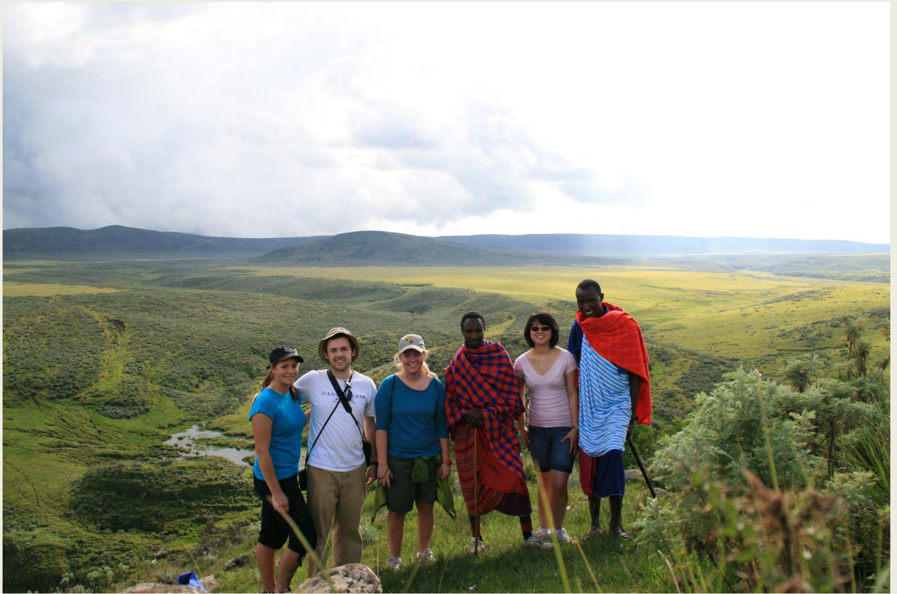
KSU vet students and Masai guides