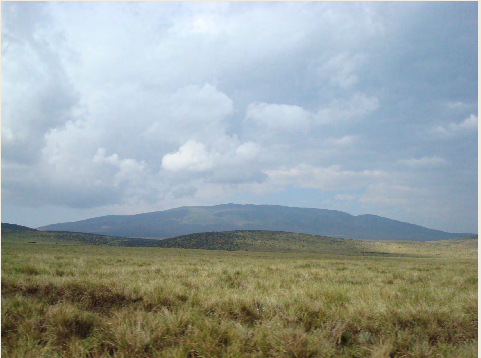
Ngorongoro Conservation Area