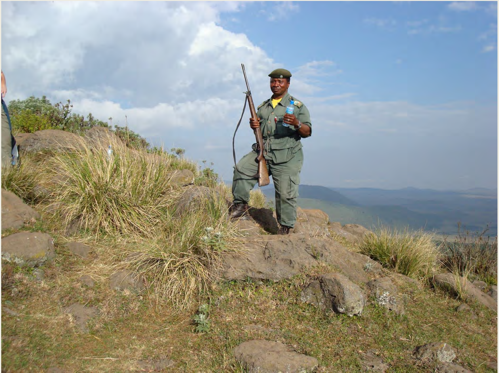
Ranger guide for hike to Olmoti Crater