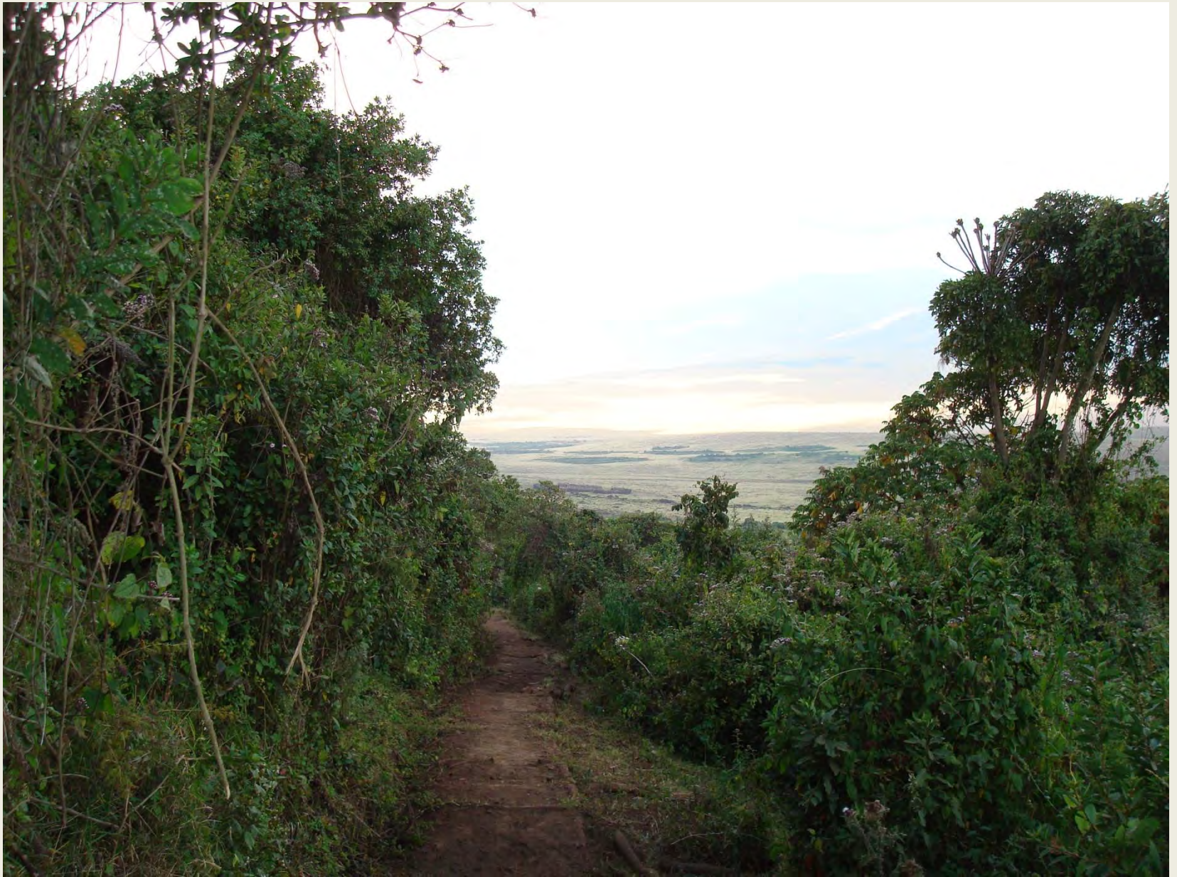
Trail to Olmoti Crater