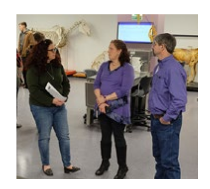
Faculty and staff check out the newly renovated gross anatomy lab on Trotter Hall's third floor.

The CVM welcomed back its first-year veterinary students with a special treat — a completely renovated laboratory with a fresh, modern look. The college held an open house for its newly redesigned third-floor gross anatomy laboratory in Trotter Hall Tuesday, Jan. 16.