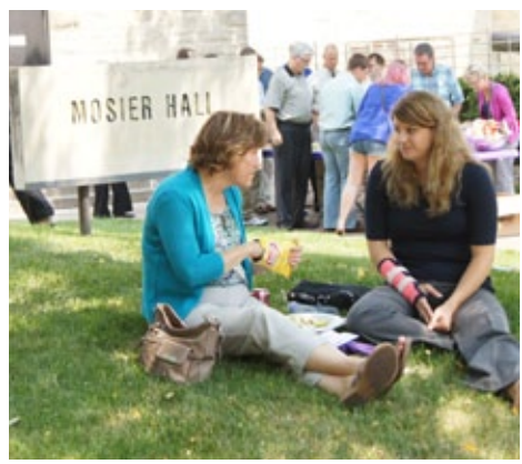
Enjoying the food and the sun outside of Mosier Hall.