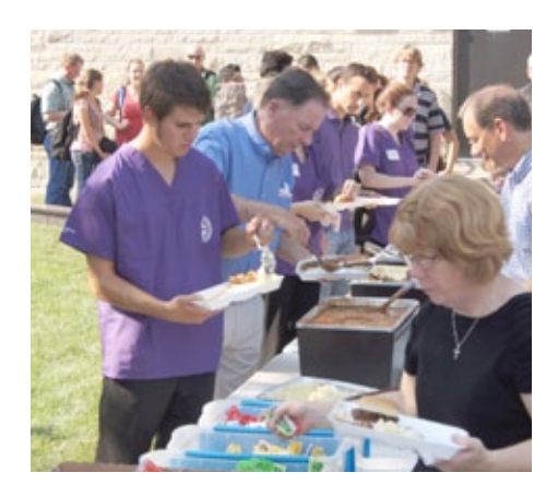
New students and their families help themselves to lunch during a break from orientation sessions.