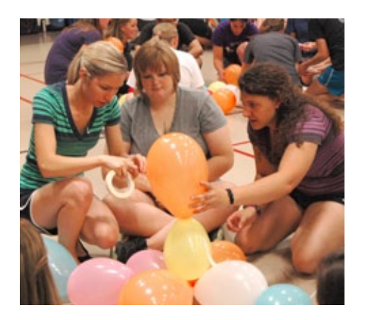
During the SAVMA team-building exercises, new students work together to build balloon towers.