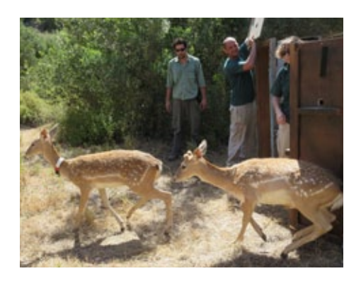
The zoo staff release a pair of fallow deer back into the wild.

I was surprised both by how many animals at the zoo are not on display and how much work had to be completed before the zoo opens each day. As a result, zoo visitors never see the entire assortment of animals cared for by zoo staff because they are unable to safely live anywhere else. In addition, the zoo conducts in ongoing research, conservation and rehabilitation