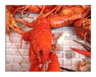
Students spend their spring break in the deep south. See page 2