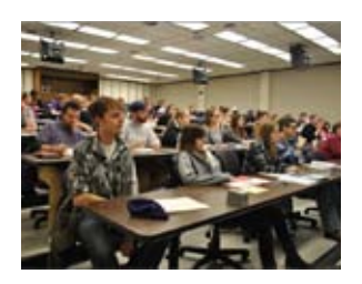
New LGVMA club hosts SafeZone training event. See page 2