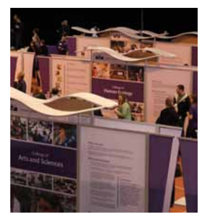
A collection of displays in Ahearn Field House celebrates the history of K-State.