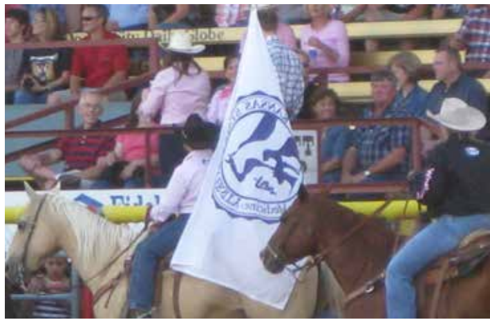
The College of Veterinary Medicine's flag is presented during the parade prior to the start of the Dodge City Roundup Rodeo.