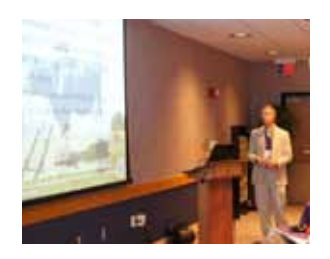
CVM hosts Conference. See page 2