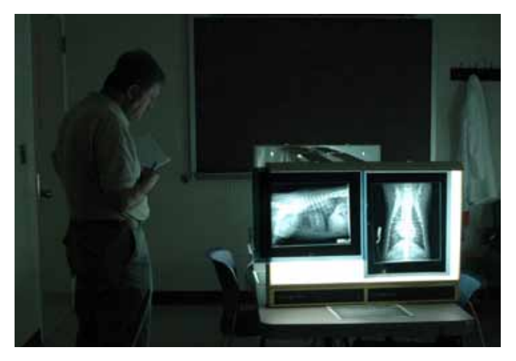
"A Peek Inside Your Patient: Radiographic Interpretations of the Small Animal Patient" was one of the wet labs offered to veterinarians. The lab allowed participants to view different radiographic case studies.