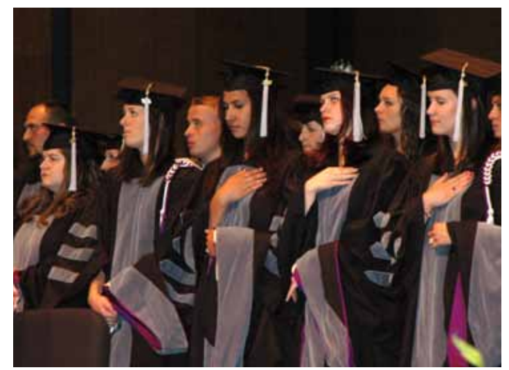
The veterinary graduates listen to the national anthem during the ceremony. Graduation was held in McCain Auditorium.