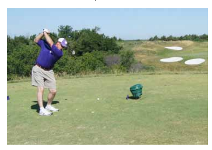
The 18th Annual Scholarship Golf Tournament was held on June 4 at Colbert Hills Golf Course. Participating teams helped raise funds for veterinary student scholarships.

The CVM hosted the 74th Annual Conference for Veterinarians on June 3-6. The conference offered many continuing education opportunities for veterinarians in the three educational tracks: equine, large animal and small animal. The event also featured a Kansas Veterinary Medical Association trade show and reception.