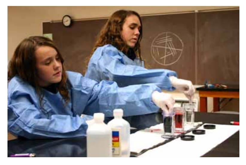
The GROW (Girls Researching Our World) program hosted an event to help promote science to middle school age girls. Over 80 girls participated in the program on Nov. 5.

A group of recent visitors to the CVM may have provided a sneak preview of some future veterinary students. The college hosted an event called "All 4 Animal Health" sponsored by the K-State Advancement of Women in Science and Engineering (KAWSE) through its program called Girls Researching Our World (GROW), which is targeted toward girls in middle school.