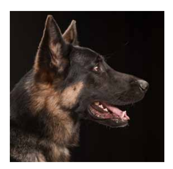
By detecting a natural antimicrobial peptide, this peptide will help dogs better fight pathogens including bacteria, viruses and fungi.

Make no bones about it, a discovery by a Kansas State University research team could mean a longer and healthier life for man's best friend.