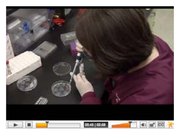
What happens behind the scenes at KSVDL? Check out the online report at: www.vet. k-state.edu/depts/development/lifelines/1107.htm

Veterinarians interested in learning more about the services KSVDL offers and how it can help service their testing needs, check out their website at: www.ksvdl.org.