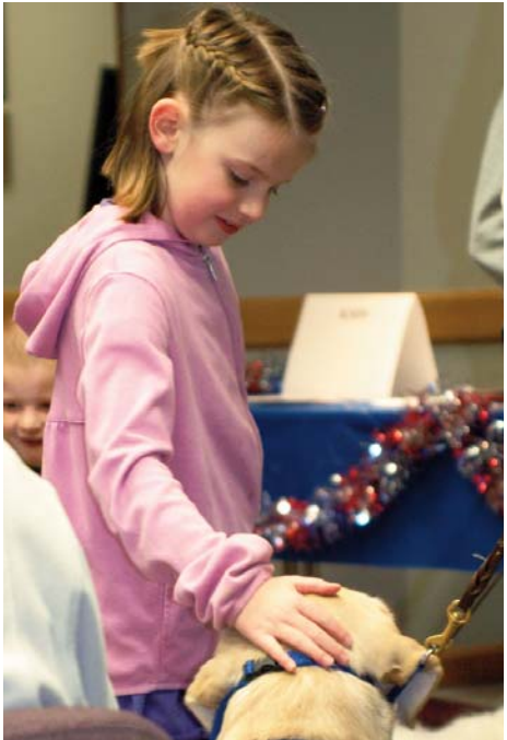
Canine Companions for Independence (CCI) brought several utility dogs from Kansas City for visitors to see. CCI's mission is to provide highly trained dogs for children and adults with disabilities free of charge.