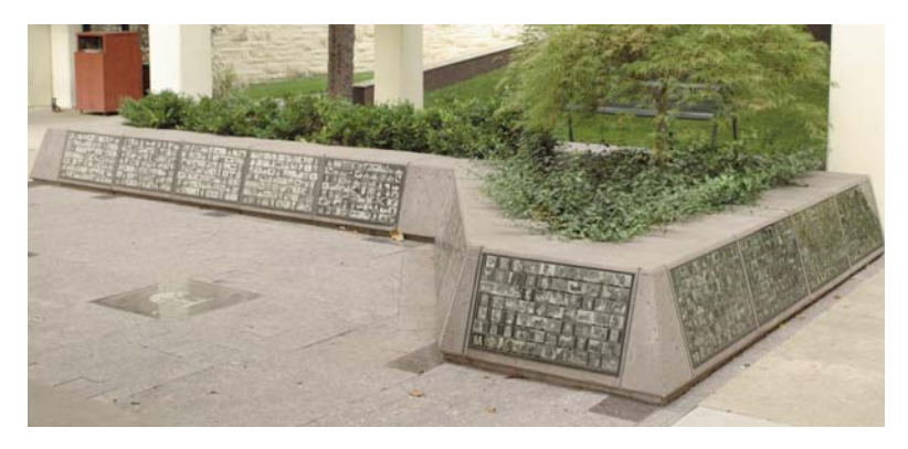
Panel No. 13, added in September, completes the south face of this section of the Whispering Garden (between Mosier and Trotter Halls). A minimum $50 contribution gives donors the unique opportunity to honor animal companions in the Whispering Garden. Donors also receive replicas of submitted photos as keepsakes.