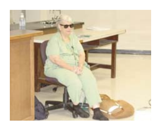
Special speaker See page 3