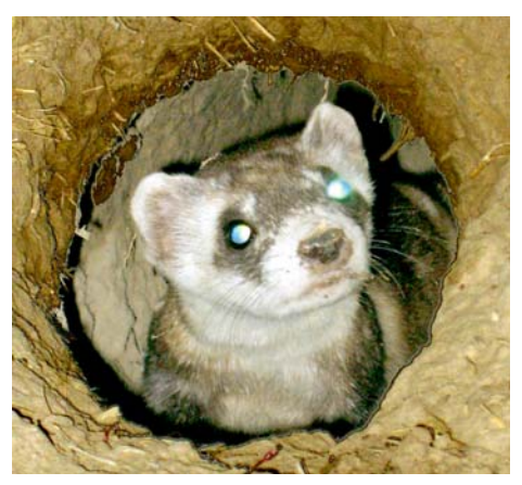
"Eye-shine" is used to help locate black-footed ferrets that live in prairie dog burrows.