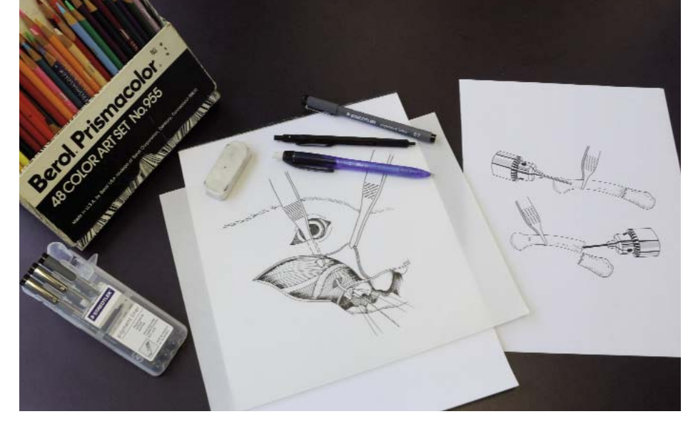
Mal has passed the first requirement to becoming a certified medical illustrator.