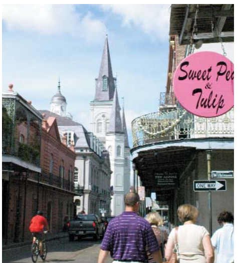
Narrow streets and ornate balconies line the French quarter in New Orleans.

This July, the second most widely seen symbol in New Orleans may have been the Powercat. The fleur-de-lis (or iris) is the city's official symbol (and can be seen on the helmets of the NFL's New Orleans Saints football team), but during the AVMA Conference, the Powercat was a fairly common sight, thanks to the presence of a strong contingent of K-State veterinarians who attended the conference.