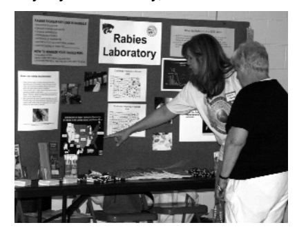
Visitors check out the rabies information booth during World Rabies Day.