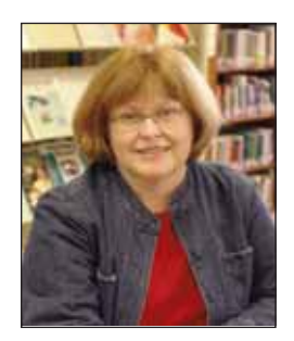
By Carol Elmore

The loss or death of a beloved animal is usually a stressful and confusing time for everyone.