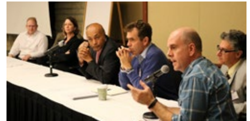
A panel discussion at the annual CEEZAD meeting with top zoonotic disease experts.

Read more in Lifelines online: www.vet.k-state.edu/lifelines/1612.html .