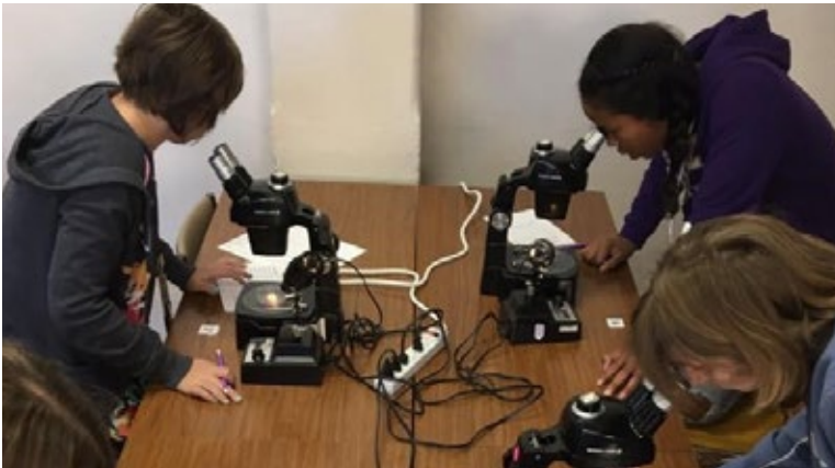
Seventh-grade students look at ticks under the microscope during a special workshop at the CVM.