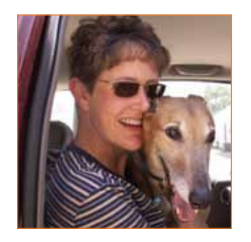
Pg. 16 Circle of Life

Fonzie gives the gift of life to others and they give back.