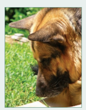
Only four cases of dogs with colonic torsion have been reported in the veterinary medical literature.