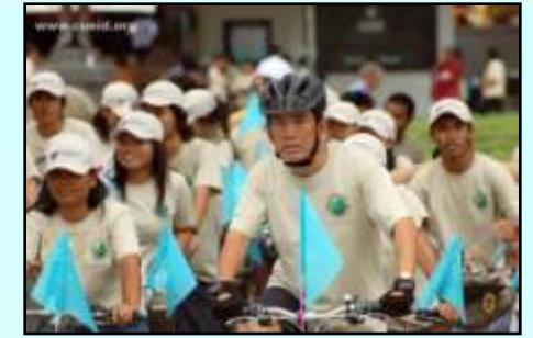
Bike ride in Bangkok, Thailand. One of numerous events to raise awareness in association with World Rabies Day.