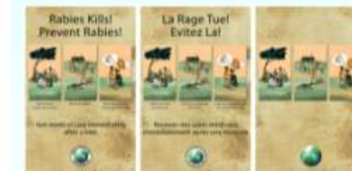
Rabies prevention poster developed at CDC for outreach to Africa

> 20 countries > 10,000 posters Washington State University School of Global Animal Health