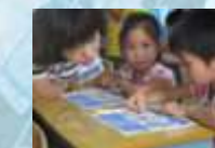
Education message testing in China

T-shirts for 36 Colleges and programs of veterinary medicine Kansas State University College of Veterinary Medicine