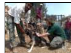
Dog Vaccinations in Jordan