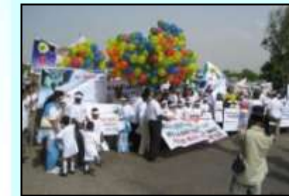
Parade in Pakistan.