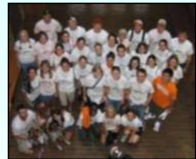
Veterinary Students at University of Tennessee, 1 of 24 Colleges of Veterinary Medicine who participated in the US

*In some countries, rabies experts convened to discuss goals and plans for rabies prevention and control, with several countries initiating a National Rabies Control Program.