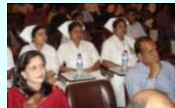
Continuing Education in Bangladesh.