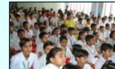
Education of Students in Hissar, India.