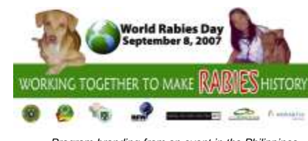
Program branding from an event in the Philippines